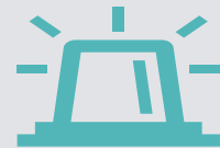
Emergency services, excluding ACT Police