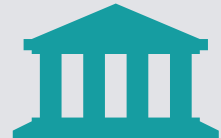
Territory authorities and instrumentalities