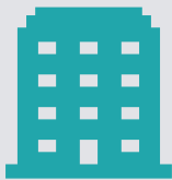
Territory-owned corporations and their subsidiaries