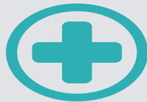
Public health services, including hospitals