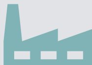
Gas, electricity and water supply, where exercising the functions is of a public nature