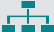
ACT Government Directorates